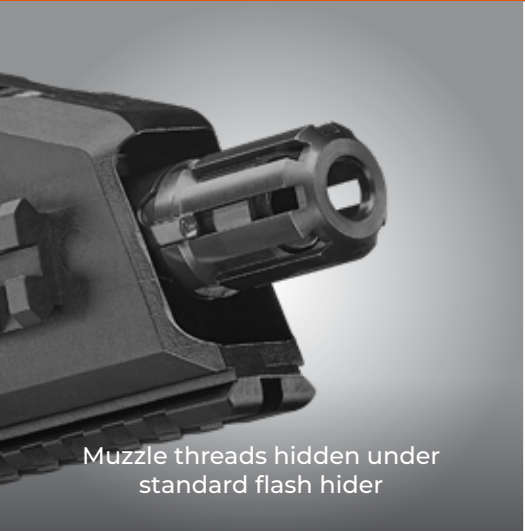
Muzzle threads hidden under standard flash hider