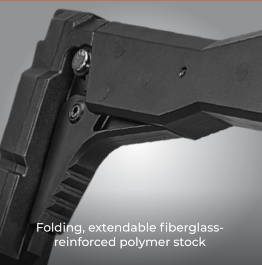
Folding, extendable fiberglass-reinforced polymer stock