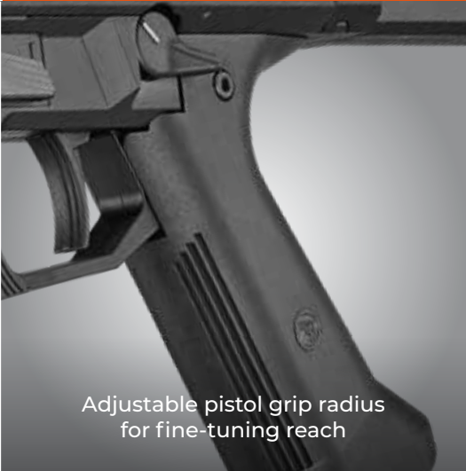
Adjustable pistol grip radius for fine-tuning reach