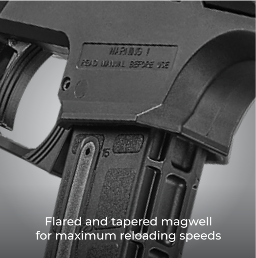
Flared and tapered magwell for maximum reloading speeds