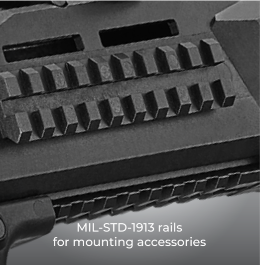
MIL-STD-1913 rails for mounting accessories